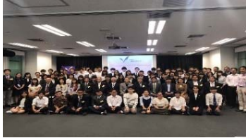
With participants to FD Workshop/CLMV Student Conference at the Meiji University ASEAN Center

In the FY2017, we have launched FD Workshop/CLMV Student Conference at the Meiji University ASEAN Center in Bangkok, with the aim of sharing problems caused by urbanizations in each country and giving suggestions for resolving them. Teaching staffs and Students were invited from selected 8 partner universities in ASEAN countries. In addition, a fieldwork to an international organization as a trial program of “PBL-type experience learning”, and active discussions among teaching staffs and students from Japan and ASEAN countries fostered a common recognition towards “Asian-type Grand Urban Plan”. On top of them, our inbound/outbound student exchange programs have successfully been done as we have planned, with close mutual relationships with partner institutions.