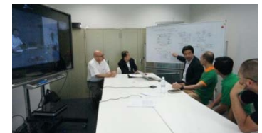
Trial of the Innovative Faculty Development Workshop at the Meiji University ASEAN Center

We have been continuously engaged in the discussion of the detail of the student exchange program and the issues concerning the Quality Assurance of it with our partner institutions. The Department of Architecture and its Graduate School has implemented a trial version of the “Innovative Faculty Development Workshop” with some of our partner institutions, which has, in fact, contributed to deepening mutual understanding of the workshop.