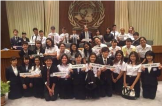
Model United Nations general assembly in Indochina Economic Corridor Excursion Program

Since the adoption of our proposal in 2016, we have been closely consulting with partner institutions about the implementation of student exchange program, and have cleared the target numbers both in inbound and outbound students.