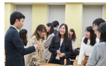
Reporting session of the student exchange programs held in Surugadai Campus, Meiji University