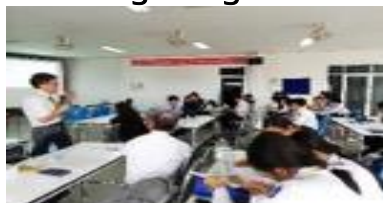
< Program in Laos (February 2019 in Laos) >