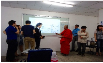
〈 Presentation and Discussion by students at the exchange program in Cambodia in March 2017〉