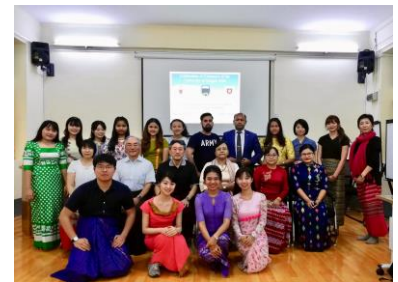
〈Externship in Myanmar, Feb. 2020〉