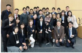
〈Workshop in Tokyo, Dec. 2019〉