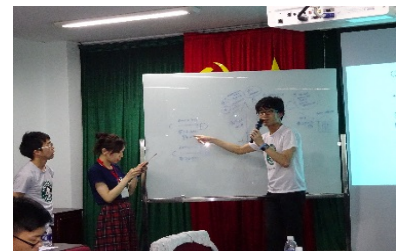
〈Presentation by Japanese students at the study program in Vietnam in March 2017〉

We are applying the quality assurance system which are used by KLS-J.D. Course: the evaluation of GPA and Faculty Development. We are sharing this quality assurance system with our partner universities. Moreover, KLS has established Keio Institute for Global Law and Development: KEIGLAD and gather necessary information to make advance the PAGLEP.