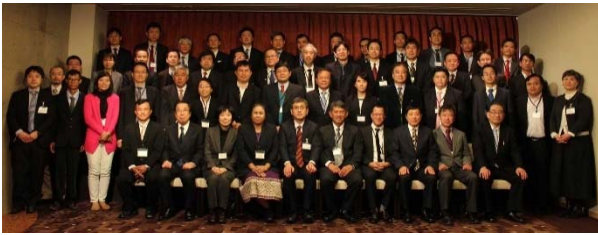
〈 Attendants of Opening FD Symposium〉

In order to prepare students mutual exchange program from FY2017, following activities are conducted.