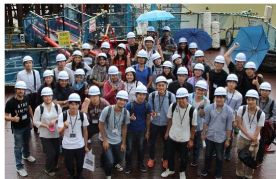
〈2. Two-directional short-term study abroad program〉