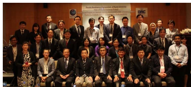
〈Attendants of the Faculty Development Symposium on November 2017, in Bangkok〉

Facebook page: https://www.facebook.com/DRC-Kyoto-University-233253546869886/