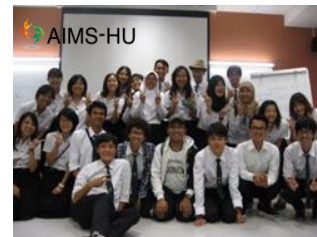
AIMS-HU Student Seminar (at Kasetsart University)

"Core-human resources" who will contribute to peace and sustainable development