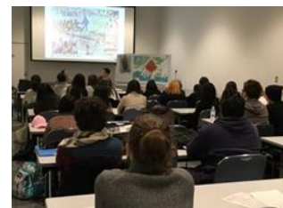
Peace Studies (Listening to the hibakusha (atomic bomb victim) testimonies)