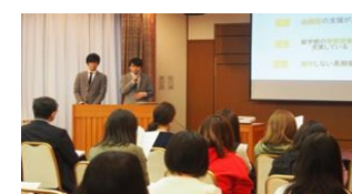
Presentations by Former Exchange Students