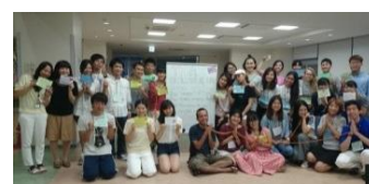
Students exchange activities (Thai Culture Day 2016)